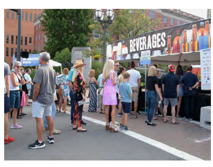
Beverages Sponsored by: