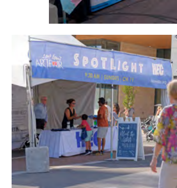
CULTURAL FESTIVALS BOARD OF DIRECTORS